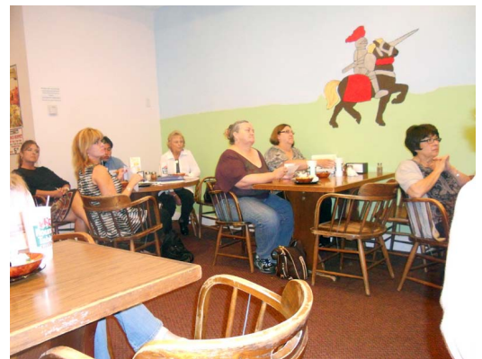
Chamber Business Seminars are great for learning and networking.

The information contributed to The Business Connection does not necessarily reflect the opinion of The Los Osos/Baywood Park Chamber of Commerce. The editor reserves the right to edit information selected for publication.