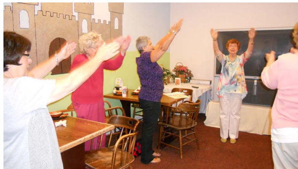
Sattie leads all luncheon guests in an exercise on writing your name in the air.